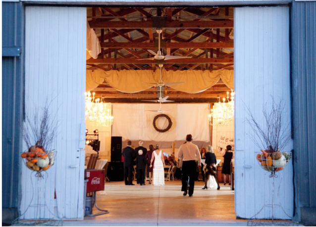
BEAUTIFUL BARN IN ILLINOIS