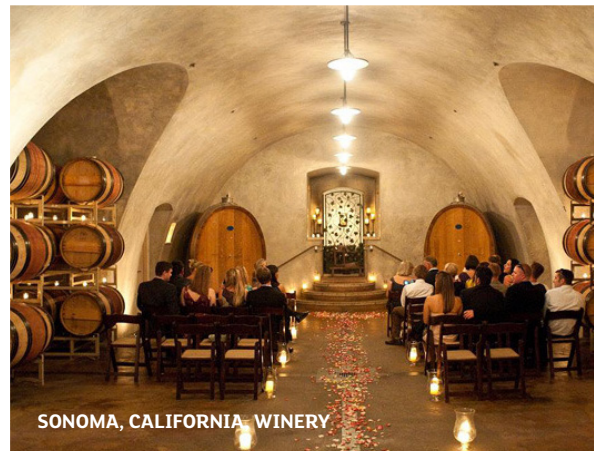
SONOMA, CALIFORNIA - WINERY

Looking for a wedding or reception site that's as special and unique as your love? Explore one-of-a-kind, character-filled locations that provide the perfect backdrop to your storybook vintage day.